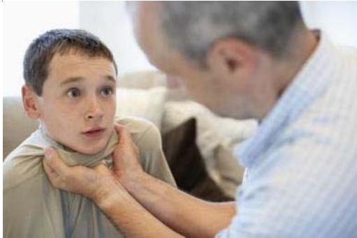
Ineffective parenting adversely affects a child's psychological, social and behavioral functioning.